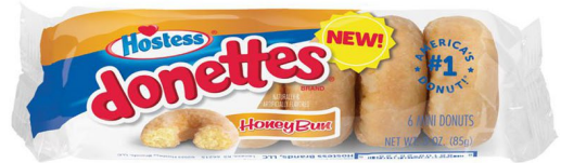
ITEM #601013 HONEY BUN DONETTES 10ct