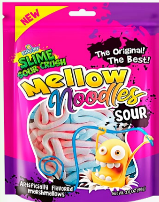
ITEM #494674 RICKY JOY SOUR MELLOW NOODLES PEG BAG $2.69 SRP $4.49