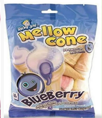
ITEM #494716 RICKY JOY BLUEBERRY MELLOW CONE PEG BAG $2.69 SRP $4.49