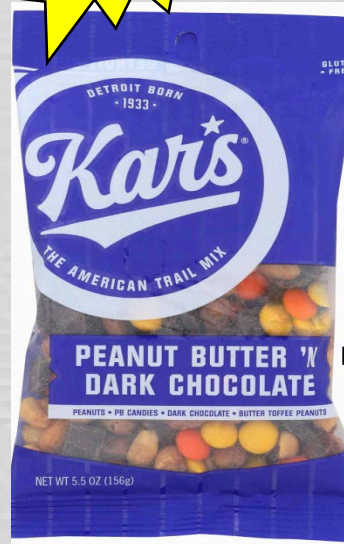
ITEM #495077 KAR'S PEANUT BUTTER 'N DARK CHOCOLATE