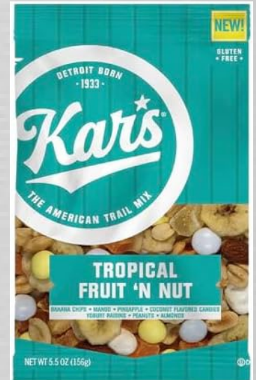
ITEM #495051 KAR'S TROPICAL FRUIT 'N NUT