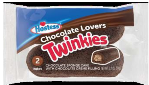
ITEM #600585 CHOC LOVERS TWINKIES 6ct