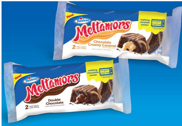
ITEM #600999 MELTAMORS CHOC/CARAMEL 6ct