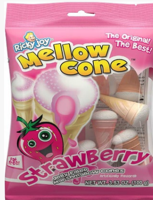
ITEM #494724 RICKY JOY STRAWBERRY MELLOW CONE PEG BAG $2.69 SRP $4.49