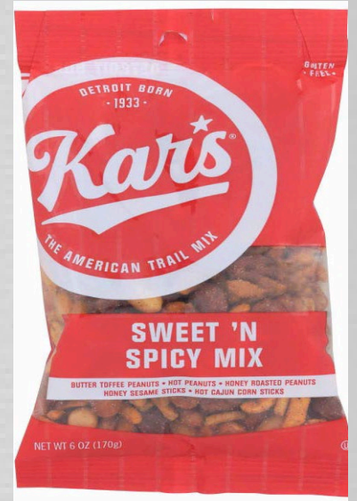
ITEM #495036 KAR'S SWEET 'N SPICY MIX