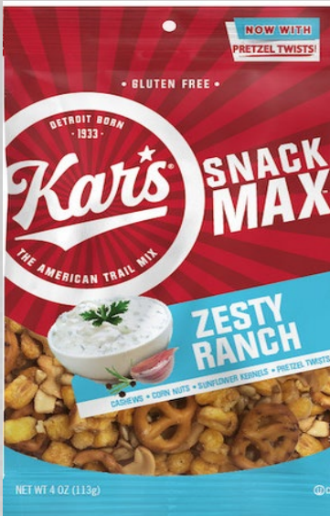
ITEM #495069 KAR'S ZESTY RANCH