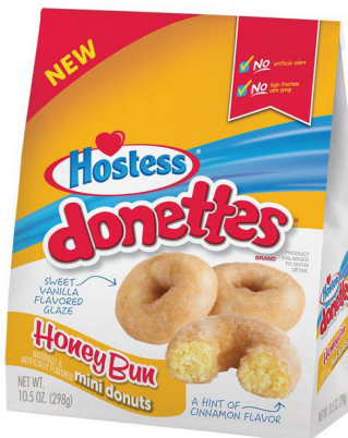
ITEM #601179 HONEY BUN DONETTES 10.5oz BAG