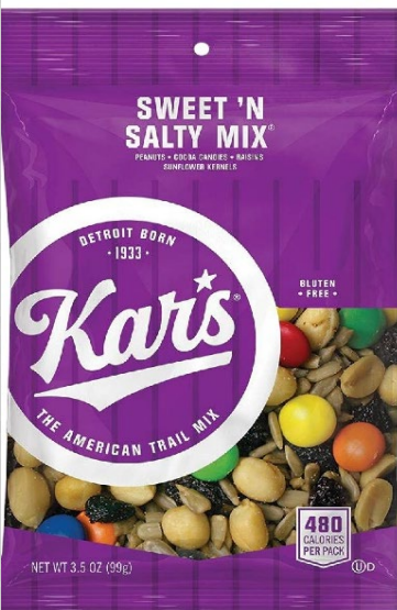
ITEM #495044 KAR'S SWEET 'N SALTY MIX