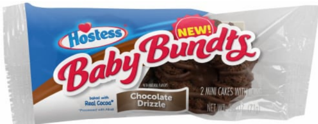
ITEM #601211 BABY BUNDTs CHOC 6ct