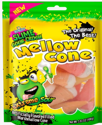
ITEM #494708 RICKY JOY SOUR MELLOW CONE PEG BAG $2.69 SRP $4.49